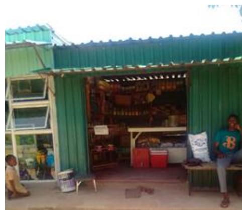
Batonga Tuckshops, Kariba, C. Mutumbami, 2023

In Kariba, the Batonga temporary tuckshops were built with prefabricated iron structures on a Council leased stand by an individual in a relatively new township where there were no prior shops. The structures were designed and implemented as temporary on a site reserved for a welfare centre in the development plan. The tuckshops, while temporary, are aesthetically built, with about 6sq meters space, and council provided ablution facilities at the site. They are rented by vendors who sell various foods - except food prepared on site - at lower prices than the large supermarket. The process involved many actors: The tuckshops were initiated after a needs assessment by Council showed the deficit in food outlets, particularly in that township, with consultation on the design and with Council inspection and licensing processes as described earlier.