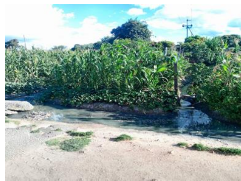
Plants grown on sewage flows, Nkulumane, Bulawayo, P. Ncube, 2023.