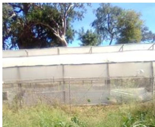
Green house, Nyamhunga school hydroponics project, Kariba, C. Mutumbami, 2023

Nyamhunga Primary school Hydroponics project in Kariba demonstrates how food systems can promote healthy ecosystems, in an area where land is a scarce resource. The project grows plants in containers without soil, producing vegetables for sale to residents and the local market and strengthening food self-reliance. The hydroponics projects started in 2022 at this government primary school, and at Nyanhehwe council primary school. The technology is applied in a greenhouse, drawing on a continuous supply of borehole water, pumped using solar energy. The hydroponics unit is secured by an electric fence to protect against baboons and elephants. Members repair and maintain these assets. The District Development Coordinator, Council, Ministry of Education and Ministry of Agriculture help to manage the projects. The hydroponics and garden activities and the water, sanitation and hygiene facilities are regularly inspected by the town health department, who also educate garden members on safe food handling.