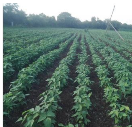
Bean crop at a plot in Dutchman's Pool area. Kwekwe. S Nowenva.2023

In Bulawayo, water scarcity has led some farmers to use waste water on crops. This violates a legal requirement that no person discharge any effluent liquid onto land or use any effluent liquid for the irrigation of any land, without approval by the appropriate health authority, including for irrigation of crops from sewage-treatment installation or oxidation ponds (GoZ, 2000). Bio-accumulation of heavy metals in crops irrigated by waste-water has been reported, especially for those crops consumed directly by people, such as vegetables and maize (Manzungu, 2012).