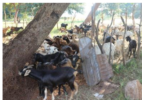
Kinshasa goat market, Victoria Falls, D Ncube, 2023

In Victoria Falls, a Kinshasa goat market was set up by the council in 1994 to provide a site for rural area goat farmers to sell meat. After concerns were raised on the sale of meat by the health department, the then director of housing of the Council proposed that farmers bring live goats. A place was allocated for the goats and the market on the outskirts of the town. The initiative intends to benefit young people who are migrating into the city in search of employment. The market has since grown, and accommodates more than 100 goats at any given time. The city intends the goat market to provide the urban community with a source of protein at an affordable price. The goat marketers skin the goats for their clients. After skinning, the youth implementing this task are given a small piece of meat (termed 'intshontsho') to thank them, giving them a daily nutritious meal. The goat- meat marketers hire a veterinary specialist from the government to examine the goats, while the police clear ownership of the goats before sales, to curb theft from the project.