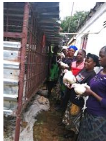
Shasha Poultry Group women holding 5 week-old chickens almost ready for the market K Salima 2023

Kariba's location in a wildlife area makes land for UA a major challenge. Padare community garden in Mahombekombe Township, the oldest settlement in Kariba town, is a sustainable garden growing and selling fruit and vegetables at affordable prices to members, residents, the town hospital and prison. During the HIV epidemic, council supported a group of people living with HIV to lease this land for free for vegetable gardening, and connected council water in the garden. Its location in a national park brings risk to crops and infrastructure from elephants, hippopotami and baboons, but an electric fence provides protection and members take turns in 24-hour guarding in case of electricity outages. The group, with about 200 members, sourced assistance from a Kariba-based non-government organization, Tony Waite Foundation, for an electric fence, a greenhouse, a water reservoir, a pump, pipes and seeds, although the greenhouse material was poorly adapted to the Kariba climate and later removed. The gardening methods are labour intensive, using simple tools and cheap chicken droppings as fertilisers.