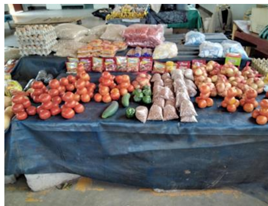
Vegetables on sale Pumula Vegetable Market, Bulawayo, P. Ncube, 2023

In Bulawayo, areas have been designated throughout the city for the sale of agricultural produce, with individuals allocated bays for which they pay a monthly rental. Vendors marketing in designated areas of the city centre provide a popular 'one-stop-shop' for a range of the fresh and unprocessed foods that they prefer at affordable cost. Council policy requires all vending to be conducted in areas where there are basic health requirements, including water and ablution facilities. A recent rise in vending in unlicensed, un-serviced sites poses a risk of disease outbreaks. Foods washed with water from city boreholes may also not be safe, with a finding that most of the 294 boreholes tested by the Council provided water unsuitable (if untreated) for direct human consumption. Council has decentralised provision of markets to the high density suburbs to decongest the central business district so that markets are closer to residential areas. The uptake of bays at these markets has, however, been poor. Some markets have remained unused, as vendors largely perceive business to be better in the central business district.