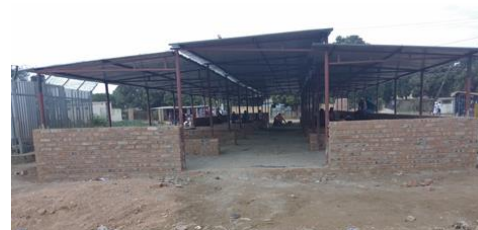
Pfupajena market under construction in 2022, Chegutu, D. Murambadoro 2022

including the poultry producers described earlier. Harare council has implemented work to improve the market infrastructure, (shown in photographs), so that foodstuffs can be stored off ground level and hygiene standards maintained. Sanitation and washing facilities have been improved in most markets.