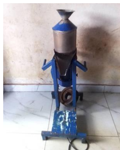
Peanut butter making machine I. Jenje 2023