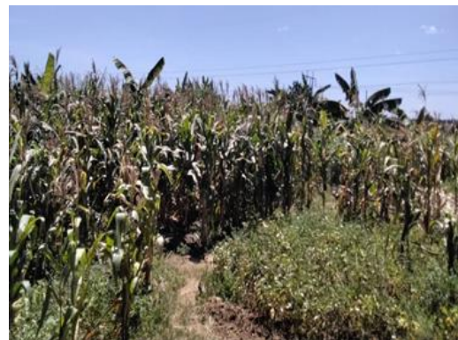
Community garden, Mbizo 9. Kwekwe S Nyoni, 2023