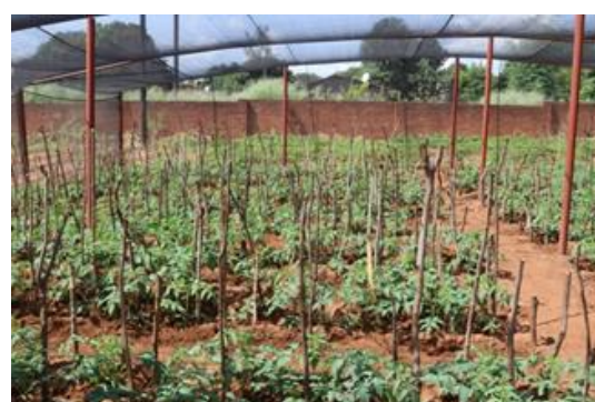
Hospital garden, Victoria Falls, D Ncube, 2023

During the COVID-19 pandemic, Victoria Falls hospital staff affected by the pandemic came together in 2020 and started a hospital nutrition garden. The MoHCC supported the staff to initiate the garden, which provided both hospital staff and patients with food for a healthy diet. The MoHCC provided the land, seedlings and irrigation infrastructure and the garden was set up in under-utilized land behind the hospital, converting a dumping site into a productive garden. About 38 hospital staff members work in groups in the garden when off-duty, together with patients able to provide this input. The garden supplies the hospital and urban residents with vegetables.