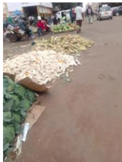
Agriculture produce displayed at 5th

Unlicensed meat vending is reported for example in Harare and Masvingo, with urban residents finding cooked meat from such vendors more affordable. The Public Health Act (CAP 15:17) stipulates that animals and birds for food should be slaughtered at registered abattoirs and prohibits unlicensed street cooking and sale of foods. In Masvingo, vending of cooked meat and maize meal often takes place in unlicensed settings by informal vendors. Unlicensed cooked meat vendors are reported in Masvingo to be major purchasers of uninspected meat, such as from stock theft, or from unauthorized abattoirs, commonly referred to as “bush kills.” The latter are known for unhygienic killing and processing methods, raising the risk of food-borne disease. When found on inspection, meat in such unlicensed sale is condemned.