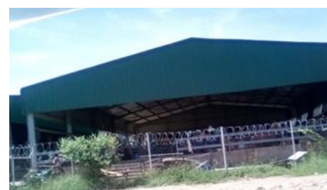
Nyamhunga fruit and vegetable market, Kariba, C. Mutumbami, 2023

Almost all the local authorities provide council markets for sale of local produce, building them in compliance with standards for food-handling premises. Many have upgraded these markets to provide a user-friendly, affordable and climate-proofed infrastructure that meets public health standards for local producers and vendors, with piped water supplies, public toilets, storage facilities, and waste management. Inspections also aim to ensure that foods not permitted to be sold in these markets, like groceries, meat or cooked foods are not sold in them.