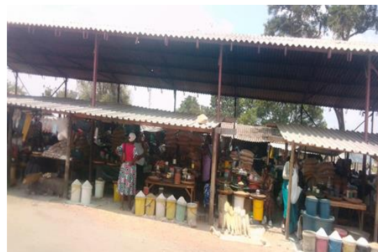
Kwekwe CBD market sheds set to be replaced with modern structures. S Ngwenya, 2023

In Kariba, the Batonga temporary tuckshops were built with prefabricated iron structures on a Council leased stand by an individual in a relatively new township where there were no prior shops. The structures were designed and implemented as temporary on a site reserved for a welfare centre in the development plan. The tuckshops, while temporary, are aesthetically built, with about 6sq meters space, and council provided ablution facilities at the site. They are rented by vendors who sell various foods - except food prepared on site - at lower prices than the large supermarket. The process involved many actors: The tuckshops were initiated after a needs assessment by Council showed the deficit in food outlets, particularly in that township, with consultation on the design and with Council inspection and licensing processes as described earlier.