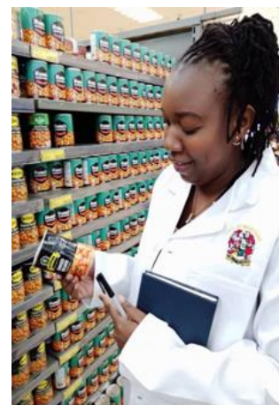
Environmental health officer conducting a food inspection S Madamombe. 2023

In all the local authorities, during operations, the Council Environmental Health Practitioners (EHPs) routinely inspect food premises to check their licensing status, hygiene, food processes, as well as the personal hygiene and medical certificates of food handlers in compliance with the law (GoZ, 2016; 2018). In Masvingo, for example, EHPs take hand swabs from food handlers and working surfaces, and send these together with food samples to Masvingo Provincial Hospital for microbial testing. Many councils train food handlers, informal food vendors and food business operators and managers. EHPs give face-to-face advice and information during inspections. Key groups also receive organized lectures. Many local authorities note constraints in implementing the desired level of training and frequency and coverage of inspections, discussed later in this document.