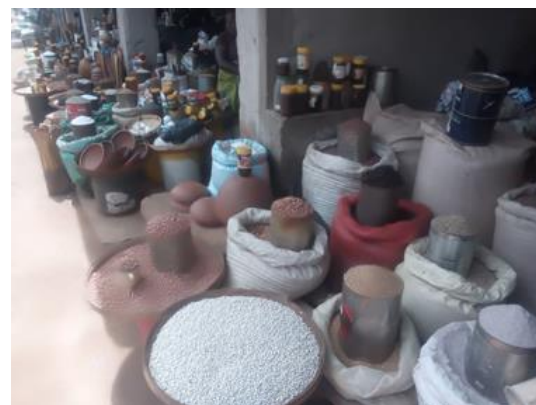
Food market in Chegutu K.Salima 2023

In Kwekwe, both during the COVID-19 pandemic and the 2008-9 cholera epidemic, the local authority bolstered preventive and control measures guided by Public Health Act (CAP 15:17) and the local authority's own Emergence Response Preparedness Plan. All food outlets were strictly monitored, and health promotion activities were increased. Local companies assisted with potable water treatment chemicals and other non-state actors (Oxfam, Plan International and others) supported the response with tents, medicines, protective equipment, buckets, beds, and allowances for frontline health workers. The robust, multi-actor response and a better potable water supply and sanitation compared to neighbouring local authorities meant that Kwekwe had no local cases of cholera in that national epidemic (Cuneo et al., 2017).