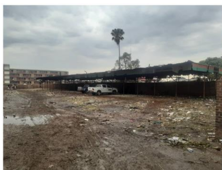
Left: Mbare farmers market before improvements. D.Tigere, 2020.