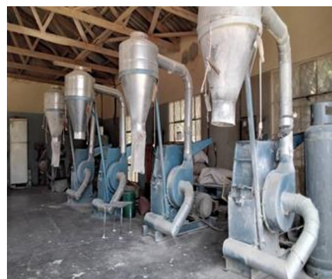
Sugden Grinding Mill in Mbizo 11 Home Industry, S Nyoni, 2023.

Urban maize milling gained momentum after the late 1990s, given the rising price of mealie meal and costly processed mealie meal brands. In Kariba, maize milling is now largely done in home industry sites and temporary council open spaces, leased on a temporary basis from the council. Residents bring maize for milling that they have purchased from council markets or from neighbouring farms. They pay a fee to the operator of the grinding mill. This assists to make maize meal affordable for low income households. The grinding mills are modern electric mills that do not produce noise or dust. Council inspects their hygiene, health and safety standards and ablution facilities. In Kwekwe, the city has established home industrial zones in six city sites where small-scale food processors operate, with maize-milling, and processing of peanut butter and cooking oil, maputi (maize corn) and 'fizzy' drinks. Various measures are integrated to promote health. Fizzy drink samples are periodically sent to the Standards Association of Zimbabwe for quality and safety compliance checks, paid for by the producer. As a further example, the grinding mill shown adjacent adds iodine and vitamins to fortify maize meal, in line with national law. Council Health inspectors monitor processors to ensure that they comply with health and hygiene standards, including those in the Kwekwe (Registration of Premises) by-laws (SI 812 1979) and Kwekwe (Public Health) by-laws (SI 501 1981).