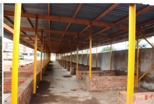
Right: Mbare farmers market after improvement showing market bays.

Kwekwe has a grade B abattoir that is currently leased to a private company. A local authority meat inspector ensures that meat sold in the city is free from zoonotic diseases and parasites, as provided in the Public Health (Abattoir, Animal and Bird Slaughter and Meat Hygiene) Regulations (SI 50 1995). The abattoir can slaughter 100 bovines a day, most coming from neighbouring areas. The meat is sold locally in approved butcheries inspected by the local authority's health inspectors as well as in other towns.