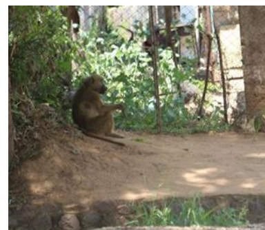
Human and wildlife contact in the city .Victoria Falls, D Ncube, 2023

Finally, UA in Kariba and Victoria Falls faces the unique challenge of human interactions with wild life, including elephants and baboons. At night, elephants destroy vegetable markets, eating vegetables and maize and destroy storage facilities for chicken feed and houses where feed is stored. Urban farmers provide an all-day watch for this, but elephants come during the night, when there is no one guarding. Local urban farmers also burn chili or beat drums to discourage elephants. The situation calls for more effective prevention and management of human and wildlife conflicts.