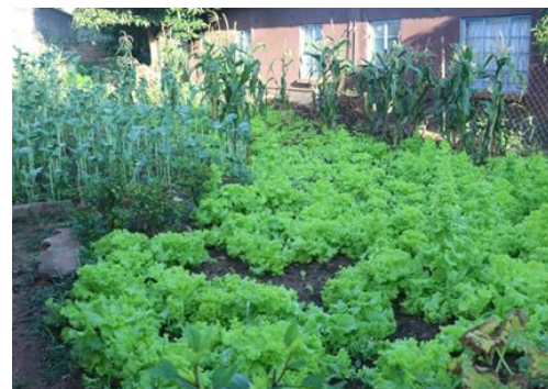
Aoretum garden, Victoria Falls, D Ncube,

When Environment Africa ceased operations, those working at the gardens and nursery have sustained the initiative up to the current date. With women's role seen as key in the eradication of hunger and malnutrition, urban planning in Victoria Falls has