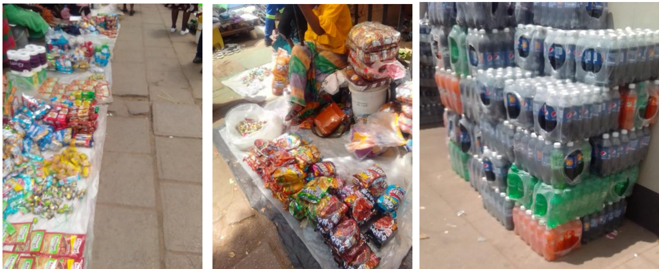
Sale of processed foodstuff and carbonated drinks along 5th Avenue. Bulawayo, P.Ncube, 2023

These foods, include sweetened breakfast cereals, soft drinks, packaged fruit juices and snacks, flavoured yogurts, reconstituted meat products (sausages and nuggets), and fast foods. Expanding formal and informal import and sale of these foods is reported in numerous urban areas, such as Kwekwe, Bulawayo, Harare, Kariba and Masvingo. A rise in non communicable diseases (NCDs) may be linked to rising consumption of these ultra-processed foods. Between 1990 and 1997, the annual prevalence of NCDs per 100 000 people in Zimbabwe increased: for hypertension from 1000 to 4000; for diabetes from 150 to 550; and for cerebrovascular accidents from 5 to 15 (Mufunda et al., 2006).