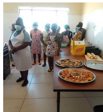
Community baking activity, Harare T. Tizora, 2022

In Harare, Tariro Youth Centre, built by the Stoneridge community, with support from the United Nations Population Fund (UNFPA) offers young people a range of food-related skills building activities , including cooking, baking, catering, sewing, gardening, fish farming and mushroom growing. Community Services officers and agricultural extension (Agritex) officers train women groups, people living with HIV, mothers of children living with disabilities and other vulnerable groups in high density areas on these skills, together with entrepreneurial skills to price and sell their products. The City facilitates exhibitions in community halls for community members to show-case their activities and products. A ‘First Lady’s cooking competition’ (promoted by the wife of President E Mnangagwa) in the Harare Gardens, and at Belvedere Teachers’ College, showcases a range of traditional foods and dishes, including boiled roundnuts, peanuts, cowpeas, whole maize grain (mutakura/umpakulwa), and dried vegetables (mufushwa/umfushwa) with peanut butter. These activities have widened awareness, preparation skills and consumption of a range of locally grown foods.