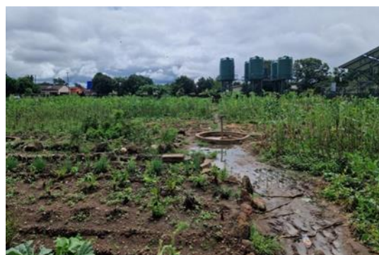
Nutrition garden at Sisk township, Masvingo, 2022

In Masvingo, while lease payments generate income for the council, a charge of US$30 per hectare per season makes land available at an affordable price to residents, while the formal process of land allocation for UA enables protection of water bodies and the environment. Urban farmers are trained through the Department of Agriculture and Rural Extension (AREX) to increase productivity on these plots. With poor rains leading to crop-wilting in some seasons, the city also enables nutrition gardens for local residents, who form farming clubs of more than ten members per garden. The council strategically places the gardens at boreholes, with solar energy driving the machinery, or in schools, with support from partners, such as Action Contre La Faim (ACF) and CARE-Zimbabwe (Bornnard, 2010; Chiwanza et al., 2015). A market provides over 300 stalls for local vendors to sell the farm produce. Sales proceeds from nutrition gardens fund other activities that members prioritise. While no vegetable processing is underway, clubs have used the income to purchase plastic waste to make products from reclaimed recycled waste.