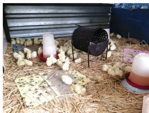
Shasha Poultry Group day old chicks brooding. K Salima 2023

As a further example, in 2023, the local authority in Kwekwe entered into an agreement with a company to manufacture organic fertilizer from municipal solid waste. In the pilot stage, biodegradable waste is collected from agricultural markets using council skip bins and delivered to the company's composting sites, with vermicomposting technology used to convert organic waste into fertiliser. If the pilots are successful, this will reduce the transport costs for and amount of solid waste deposited at the Council's dumpsite, reduce emission of methane gas, and generate income for residents involved in waste reclamation and recycling. The company will build composters for residents, and organic refuse will not be placed in bins for municipal collection. The company will purchase the processed compost from residents to make fertiliser, further supporting incomes and UA. In a further example of this potential for innovation, in Chegutu, groups involved in some of the activities outlined earlier were given training in business entrepreneurship and in technologies like hydroponics and aquaponics. Shasha Community group members are involved in 'mukando', a revolving round- table loan scheme where they group together and contribute equal amounts of money. This provides funds for agreed loans to members to boost their earnings, and to create business opportunities, employment and new income sources for other members in the community, especially those with less capital.