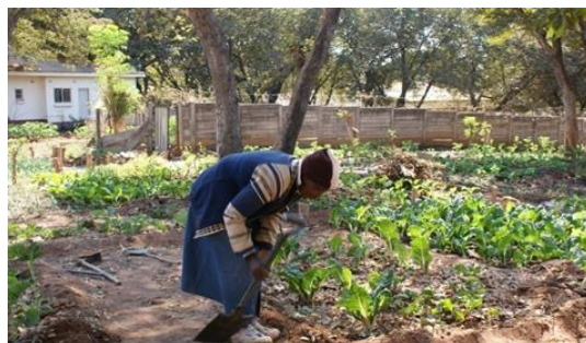
Joy support garden, Victoria Falls, D Ncube 2023

Victoria Falls Council views that it has a responsibility to support the food needs of vulnerable groups, including elderly people and women living with HIV. In 2007, a chicken project was initiated to support healthy and nutritious diets for the elderly people in an old-people's home in the city, given the difficulties they faced with meeting food needs in the hyper inflationary economy of that time. While the products were initially only used in the old people's home, the fowl-runs now accommodate up to 1000 birds at one time, and the poultry are sold commercially, with the income from the sales supporting poultry feed and other inputs. In 2003, the Council implemented a nutrition and herb garden for women living with HIV in a 'Joy Support Group' to garden herbs and vegetables. The vegetables (chomoulier, carrots, green beans, peas, lettuce, spinach, tomatoes, onions and herbs) are used to cook nutritious foods to boost their immunity. The city has supported the women by fencing and connecting the gardens to the council water system, while local non-government organisations have provided advice on pest control and marketing. The women sell the surplus vegetables to the local community and the city's main supermarket. Their vegetables are preferred as they use organic fertilisers.