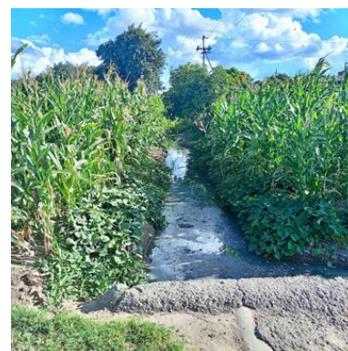
Crops grown in sewage, Luveve, Bulawayo, P. Ncube, 2023

While there is widespread UA, there is a gap in local food processing to add value to products from UA, and some constraints in land, water and other resource inputs for food processing activities. The current load-shedding in many urban areas raises a further challenge for food processing. There was some use of solar energy, or of manual machinery to address these problems, but the need to improve the link between water, energy and effective food systems was evident.