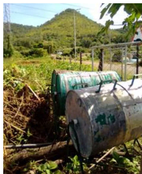
Padare garden tumbler drum and compost, Kariba C. Mutumbami, 2023

For example, Padare community garden in Mahombekombe Township, Kariba, noted earlier, is also a site of innovation. The garden has a pilot scheme to compost organic waste from the township to produce fertiliser, using tumbler drums donated by GIZ, testing an approach for possible city-wide scale-up, to reduce landfill waste. To date, the results indicate that the tumbler drum technology is too costly as the drums are not durable. Group members have thus proposed production of a more durable version of the tumbler drum.