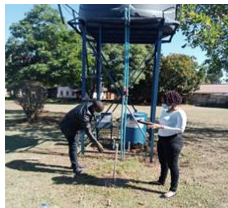
Environmental Health Practitioners collecting water samples for analysis, Harare, C Muwombi, 2022